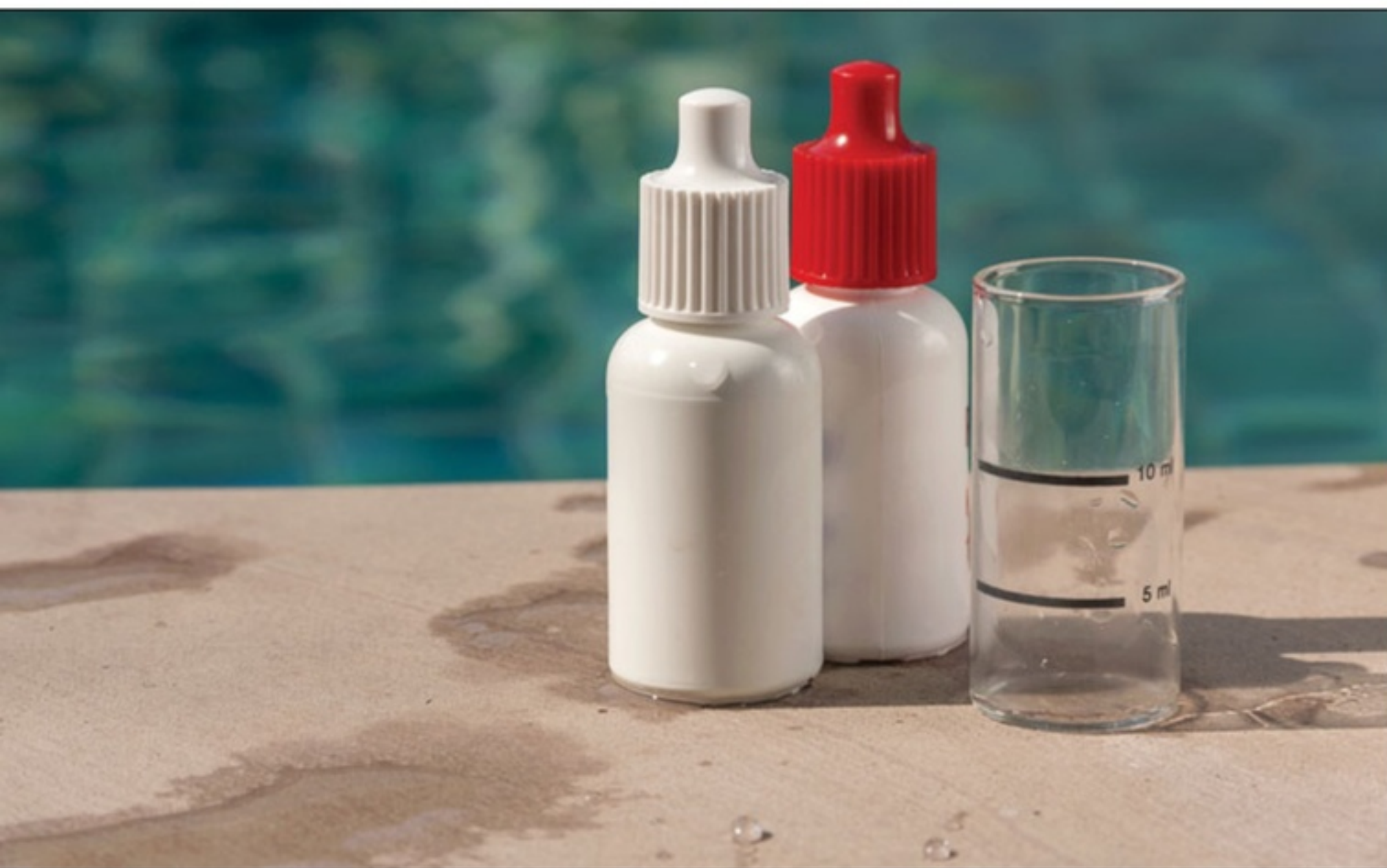
LIQUID REAGENT BOTTLES SUCH AS THESE SHOULD BE KEPT CLEAN AND STORED IN A COOL, DRY PLACE.

Potassium monopersulfate (MPS or potassium peroxymonosulfate) is a non-chlorine oxidizer that will interfere in the total chlorine DPD test. Treating recreational water with MPS to remove bather